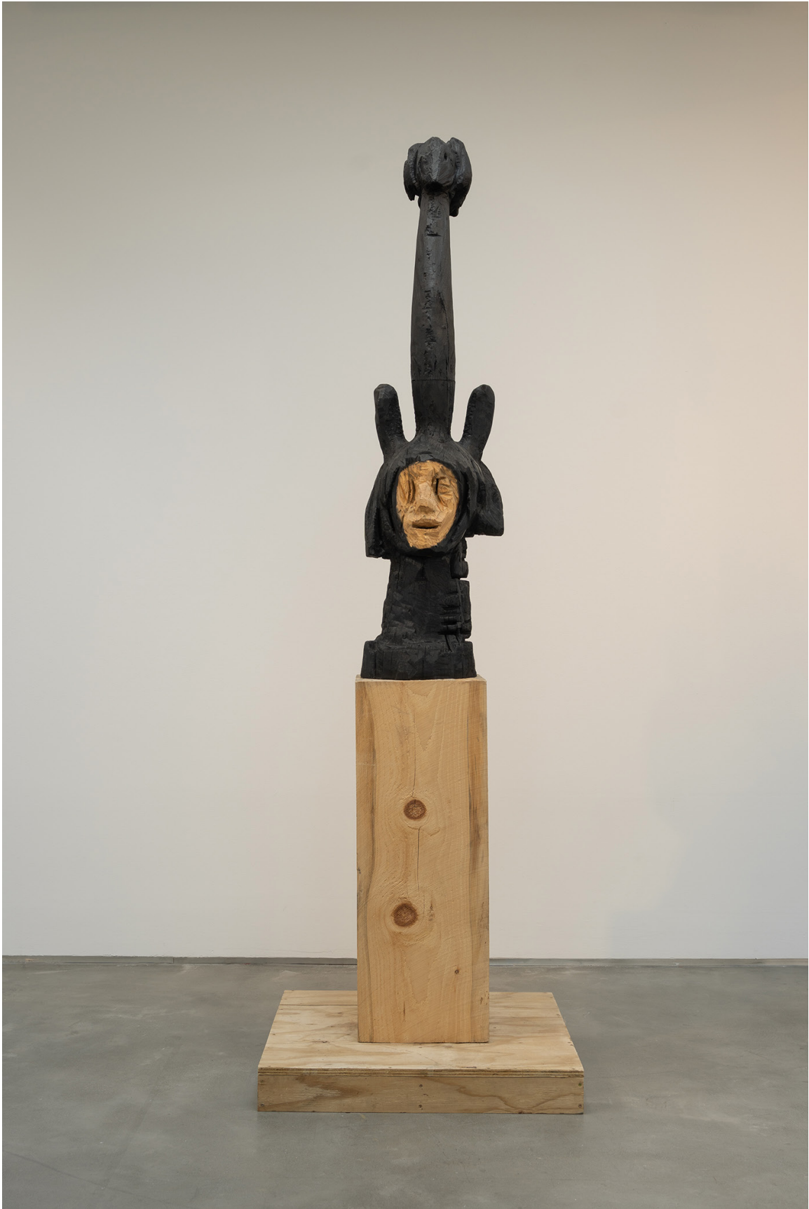
Custom-made, 2024, Charred basswood and pine, 105 x 32 x 32 in