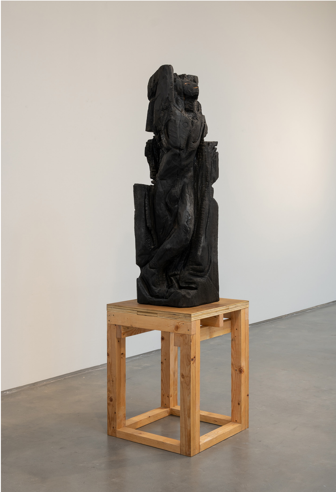
The idealist, 2024, Charred basswood and pine, 74 x 21 x 21 in