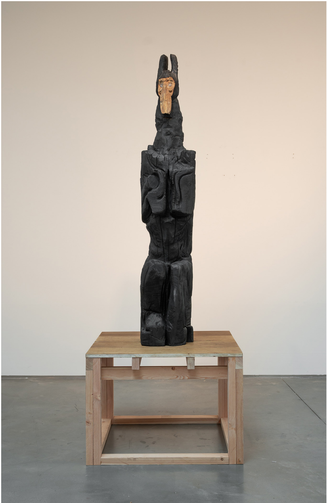
Talulah, 2024, Charred basswood and pine, 90 x 40 x 32 in