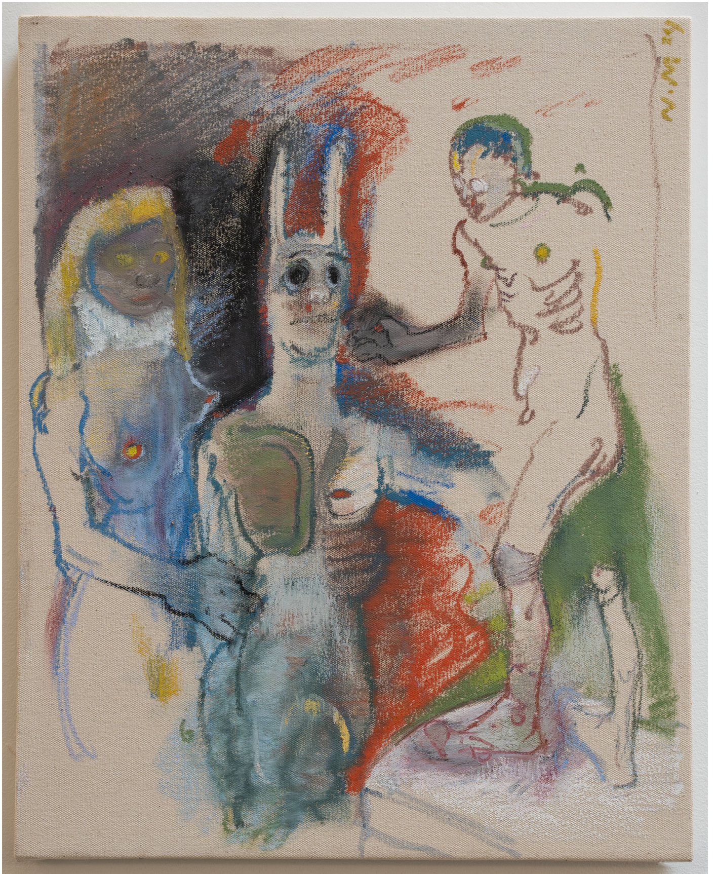
Alive VIII, 2024, Oil stick on canvas, 20 x 16 in