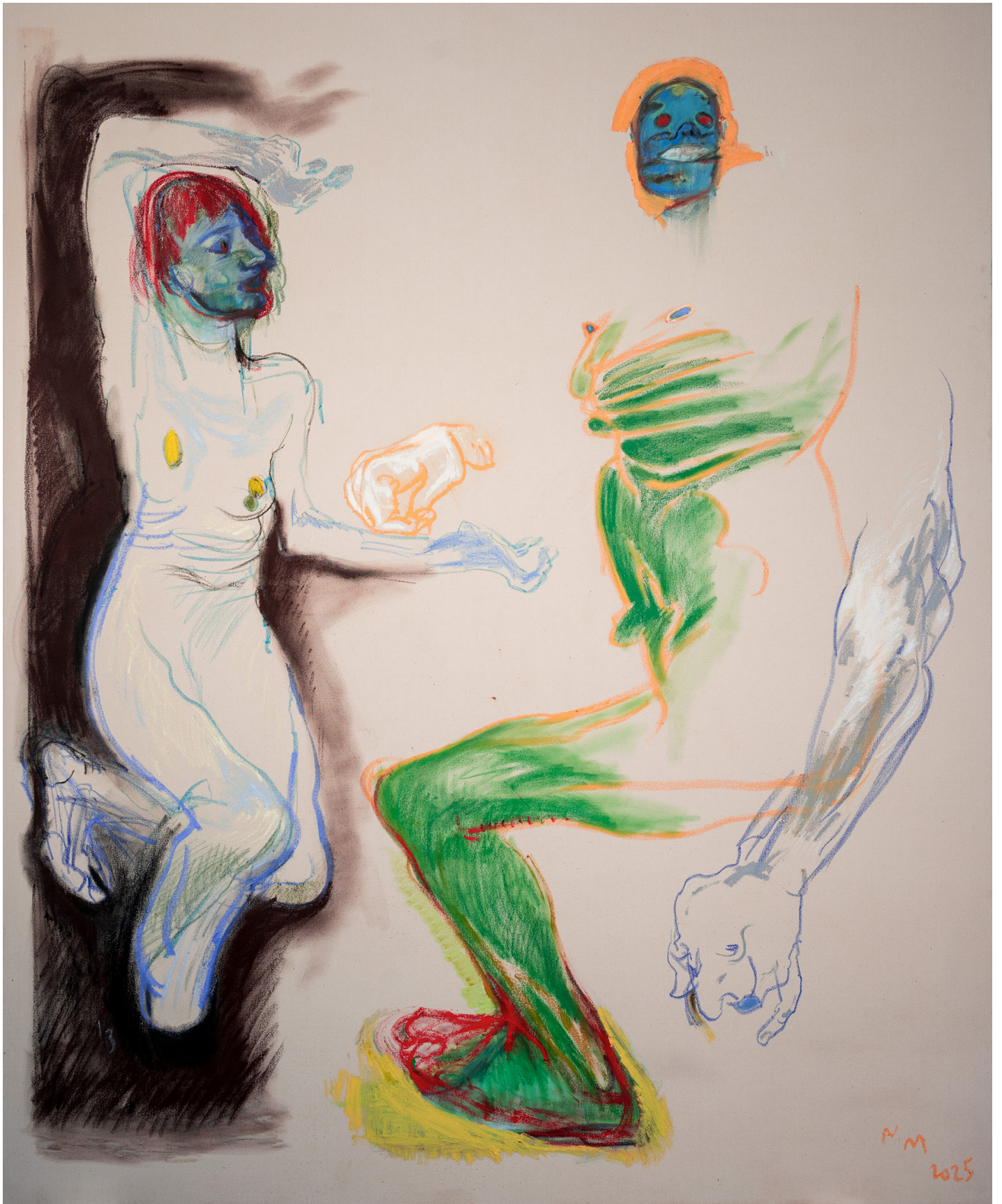
Alive XI, 2025, Oil stick on canvas, 102 1/4 x 68 1/2 in