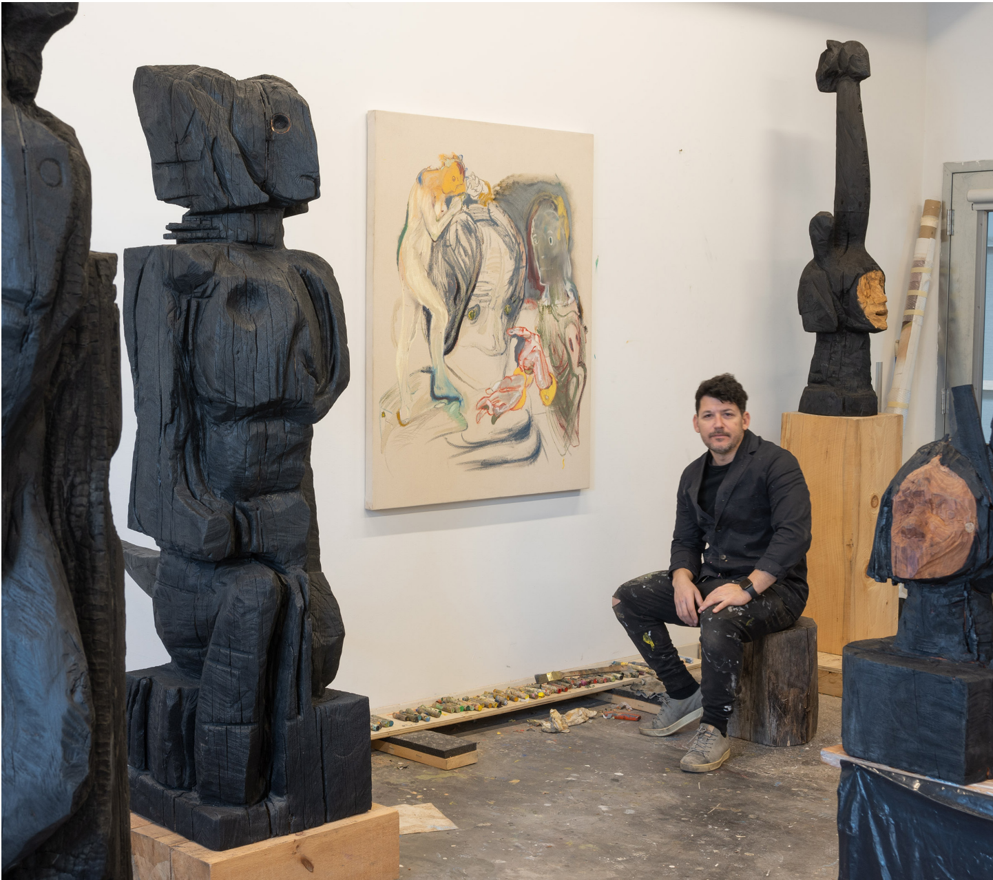
Studio view at NXTHVN