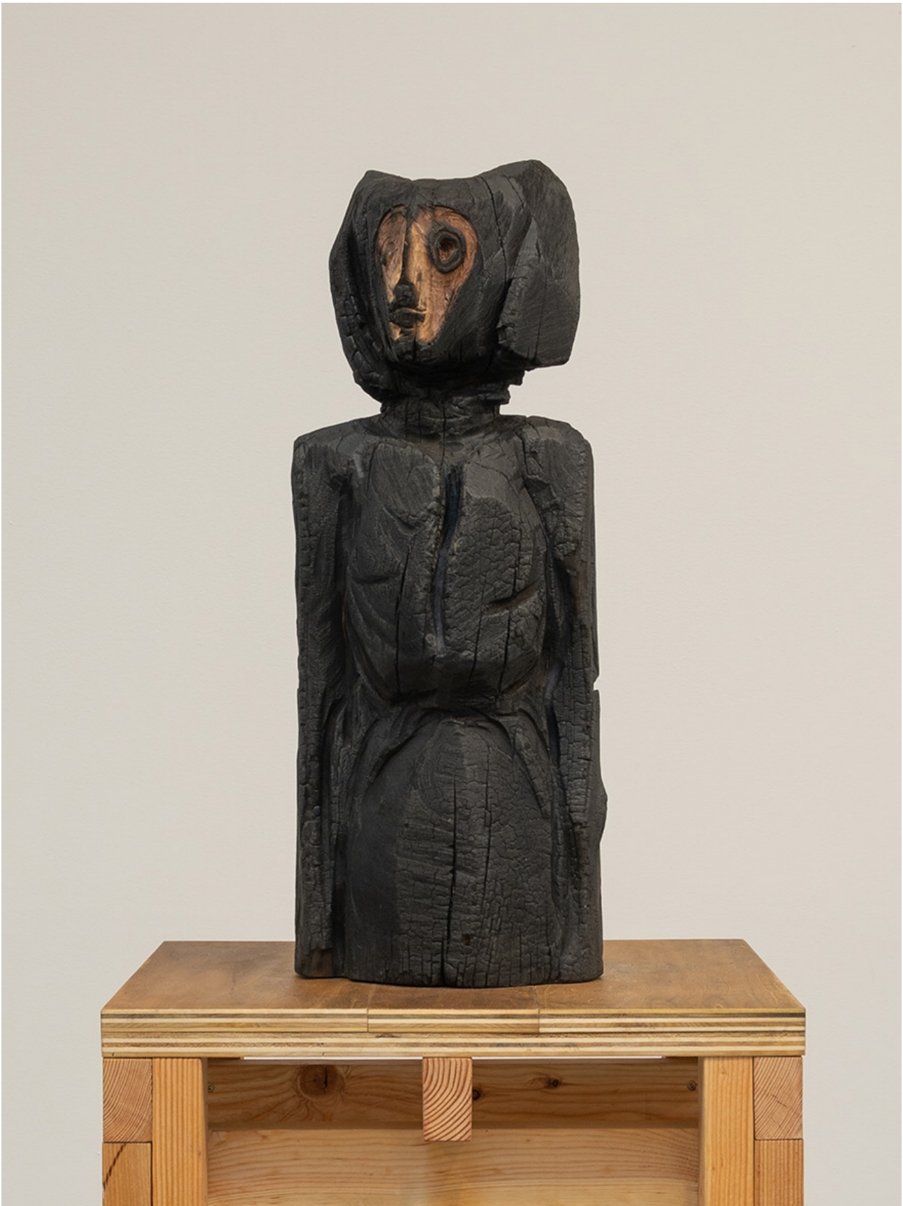
Little spirit, 2024, Charred walnut, 27 x 15 x 10 in