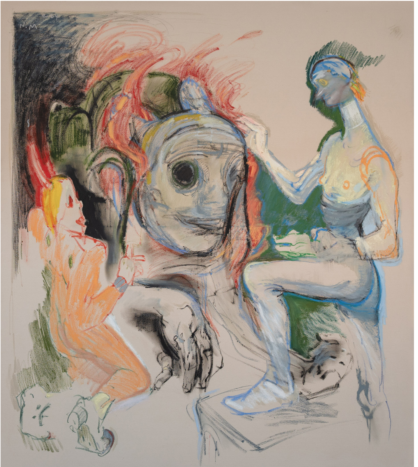
Alive VII, 2024, Oil stick on canvas, 95 x 79 in