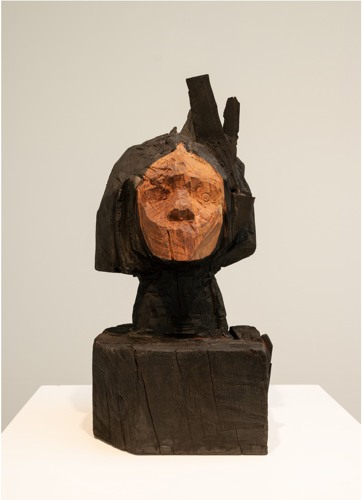
Untitled, 2025, Charred wood, 19 1/2 x 10 x 9 in