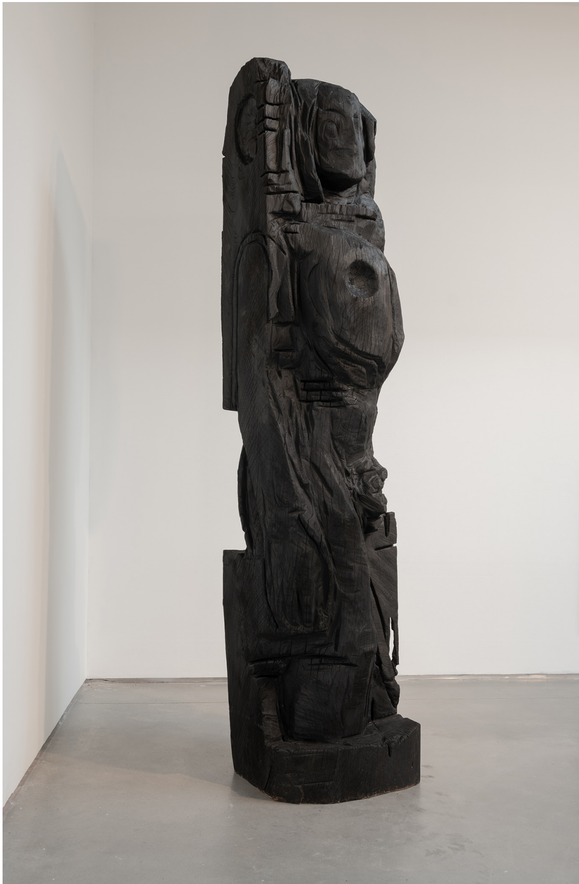
Warrior, 2024, Charred beech wood, 108 x 24 x 24 in